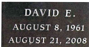
Added by RWCNAC